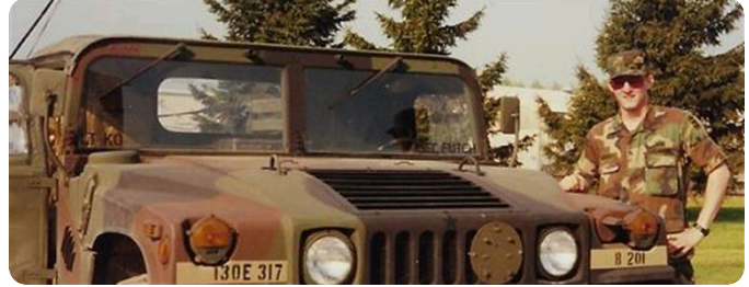
1989 HMMWV driver SPC Russ