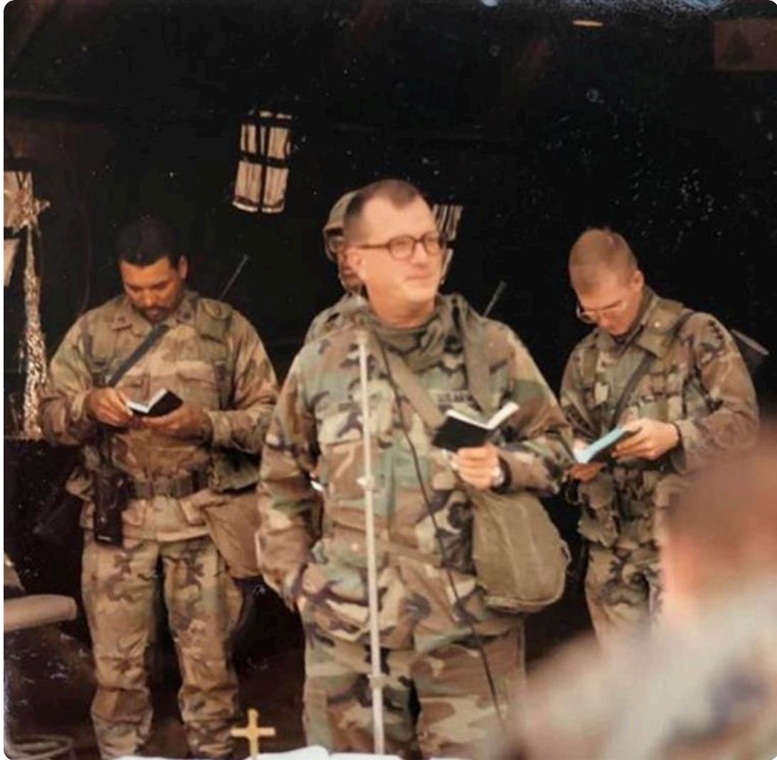
CHRISTMAS EVE 1990, SAUDI ARABIA