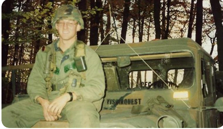
1989 Germany Russ